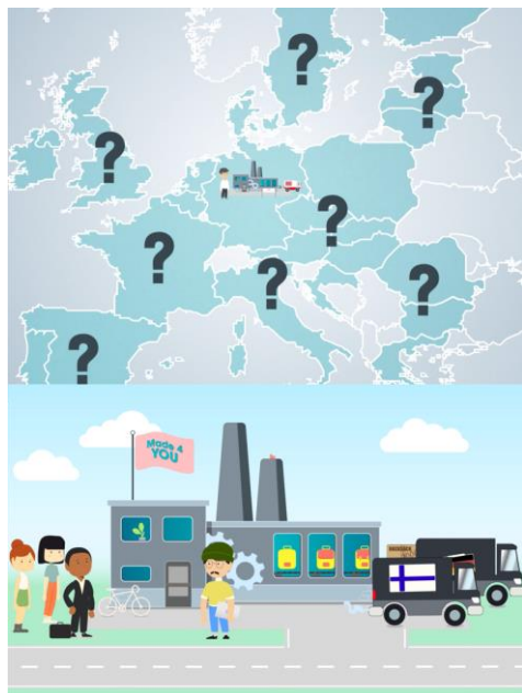
Interactive Video Case Studies

The INTENSE Team is proud to announce that all of our teaching material, worth 20 ECTS and a detailed teaching manual on the INTENSE Teaching approach to support the lecturers is now online! Our team has worked ever so hard over the past three years to develop this material and make it available online for your use. Our innovative, engaging, and relevant material is a mix of interactive lectures, blended learning, and traditional lectures supplemented with e-learning, case studies, and interactive videos. You can access this information on our website from the following link: http://intense.efos.hr/index.php/teaching-materials/ .