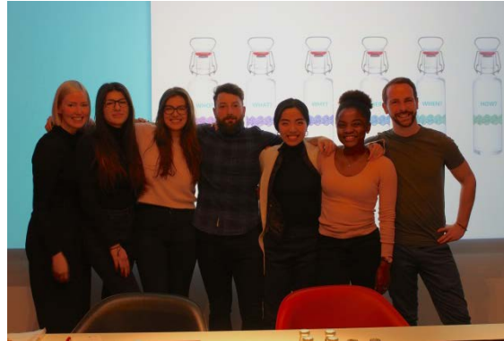
HTW student teams at the multiplier event at Berlin Business Location Center