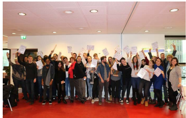
Group picture with certificates