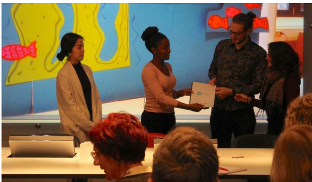
Students hand over their consultancy report