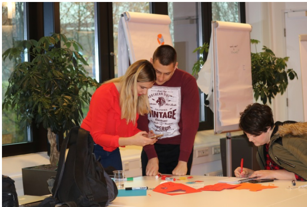
Working on an introductory video